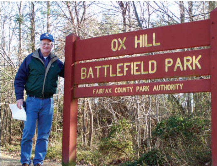
taken following "The Battle of Chantilly (Ox Hill) Movie Premiere on March 4.