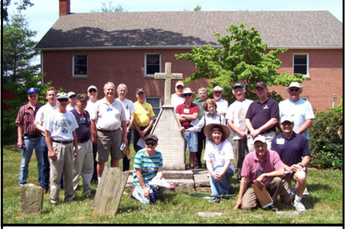
Bristoe Campaign Tour Participants at Greenwich

If you missed the opportunity at the June meeting to order an enlarged copy of the map of our area commissioned by Union General Irwin McDowell, you have another chance. Bring your $10 to the August meeting! You can pick it up at the September meeting. All orders must be prepaid and profits benefit the BRCWRT Round Table.