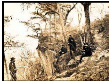
Gen. Grant at Roper's Rock, Lookout Mountain.